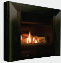
Galaxy black with black trim.

This information is not intended as an installation guide. Please consult product specification, available at www.rinnai.co.nz , by clicking the Tradesmart link. Specifications may change without notice.