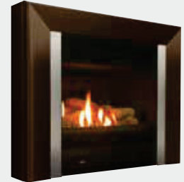
Dark bronze with stainless steel trim.

Rinnai Reflection Advance Frame colours: galaxy black or dark bronze.